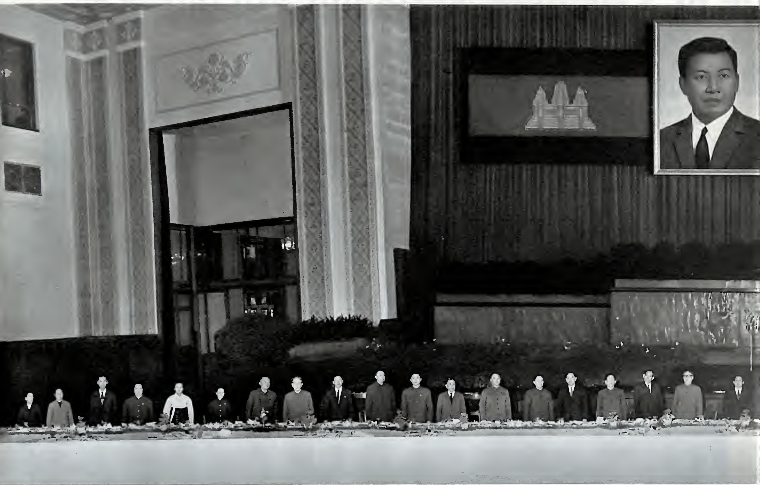
At a grand banquet given by Premier Chou En-lai in the evening of April 12 to warmly welcome Samdech Norodom Sihanouk, Head of State and Chairman of the N.U.F.C., and Madame Sihanouk on their arrival in Peking after their tour of the Liberated Zone of Cambodia.